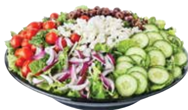
Colossal Greek Salad This Mediterranean-style salad is made with crisp romaine and iceberg lettuce, sliced cucumbers, grape tomatoes, red onions, black olives, crumbled feta cheese and Greek dressing. Serves 10.