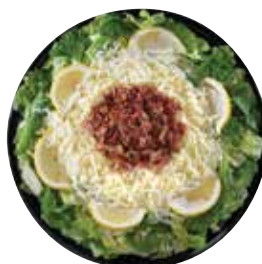
Caesar for a Crowd Inspired by tradition and prepared with fresh romaine lettuce, real bacon bits, Parmesan cheese, lemon wedges and creamy Caesar dressing. Serves 10.