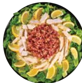
Chicken Caesar for a Crowd Made with romaine lettuce, shredded Parmesan cheese, real bacon bits, seasoned chicken breast slices, lemon wedges and Caesar dressing. Serves 10.