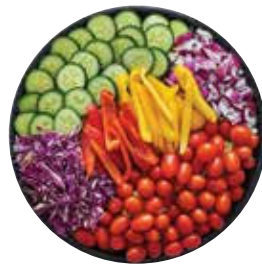
Gardener's Harvest Salad Romaine, spring mix and iceberg lettuce topped with cucumbers, grape tomatoes, red onions, red cabbage, sweet peppers and balsamic vinaigrette. Serves 10.

Fruit and nuts enhance the salad's flavours