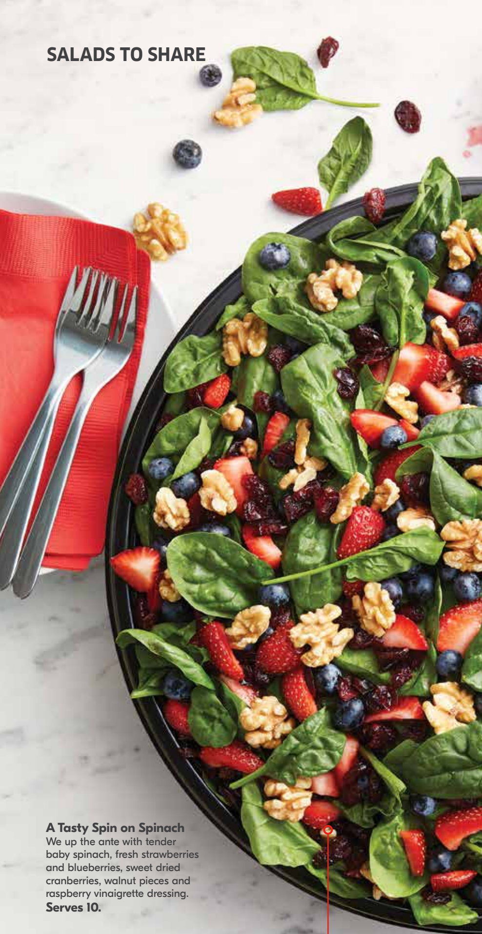
A Tasty Spin on Spinach We up the ante with tender baby spinach, fresh strawberries and blueberries, sweet dried cranberries, walnut pieces and raspberry vinaigrette dressing. Serves 10.

Fruit and nuts enhance the salad's flavours